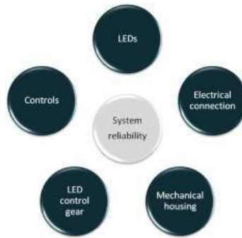
Figure 1: Luminaire life is about system reliability

One remark. If an LED luminaire is equipped with a replaceable LED module, luminaire life can be decoupled from the LED module and its life. This brings luminaire life closer to the current definition of luminaire life for conventional light sources. For instance, the life of road lighting luminaires is often 30 to 40 years. However it is preferable to publish the LED module life as the LED luminaire life.